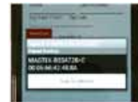
Fig. 2 Select "MAGTEK-*****".

Once you are connected, the QwickPAY app will display a green bar at the top of your screen which reads "Device Connected". You will also notice that the green LED light on the BulleT has stopped flashing and is now a solid green light.